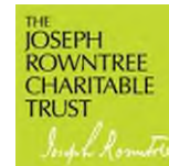
Joseph Rowntree Charitable Trust