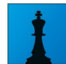
LA FINANCIERE DE L'ECHIQUIER