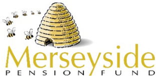
Merseyside Pension Fund